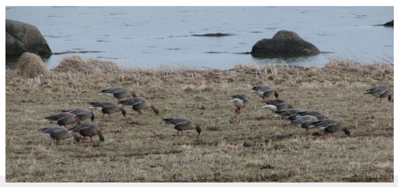
Feeding Pink-footed geese at Andøya April 2007.